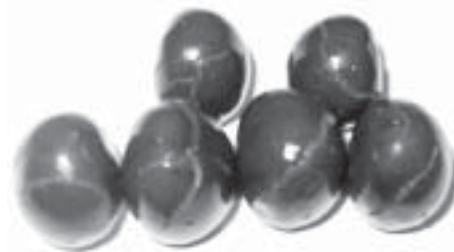
Figure 4. Cracking was a problem in LifeSpan 204 and 208 bags in the Hedelfingen trial. This problem can be minimized by ensuring the fruit are not wet at the time of packing.

cracks and defects. For MAP storage, cherries were placed in two different kinds of microperforated, polyethylene bags with different oxygen transmission rates (OTR): LifeSpan L204 and LifeSpan L208 (Amcor Ltd). The modified atmosphere (MA) bags selected for the trial are presently available for commercial use on cherries. The bags were closed tightly using plastic sealing clips, and then placed in small plastic crates. All the samples were placed in a storage chamber maintained at 38°F and 90 percent relative humidity. The study was designed for a four-week storage period; with evaluations performed every seven days.