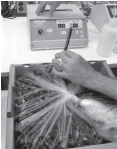
Figure 2. Gas measurements were taken weekly to determine the oxygen and carbon dioxide concentrations in the bags.

in retail stores. The success of MAP depends on the physical properties of the film which determine permeability to oxygen and carbon dioxide, and the respiration rate of the product which is partially dependent on harvest date, maturity, variety, temperature and other factors. Incorrect use of MAP could result in anaerobic (low oxygen) conditions leading to product spoilage.