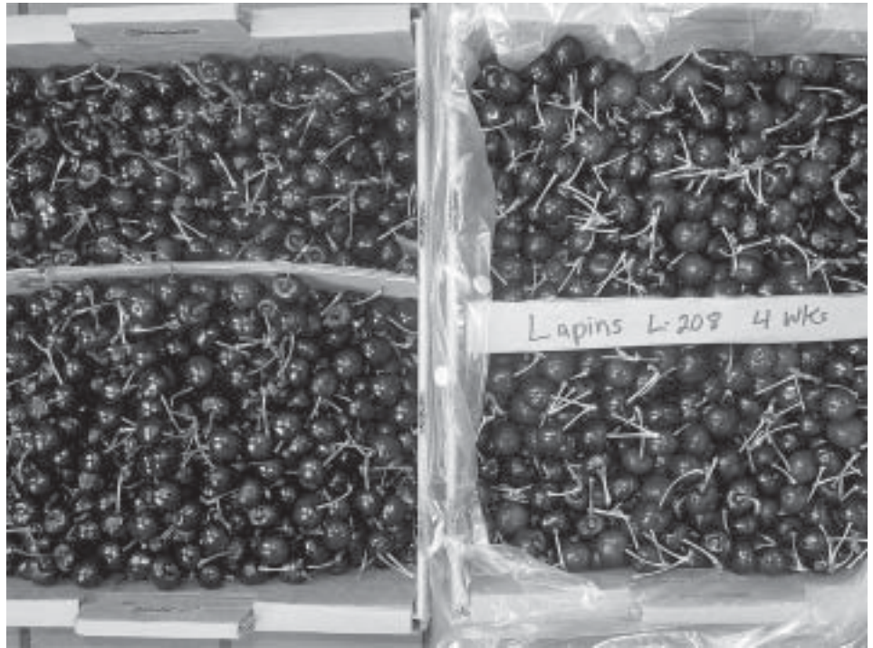
Figure 3. Lapins control cherries (left) got darker after four weeks of storage and stems turned brown. Cherries in LifeSpan 208 bags (right) maintained green stems and fruit color was similar to that at harvest.

Sweet cherries var. Hedelfingen were obtained from the New York State Agricultural Experiment Station in Geneva, courtesy of Dr. R. Andersen and Dr. T. Robinson's programs. The cherries were hydrocooled with chlorinated water within three hours of harvest. The treatments compared regular air storage with modified atmosphere storage in low-density polyethylene bags (LDPE). Each treatment replicate contained 10 lbs. of cherries that were graded by hand to exclude