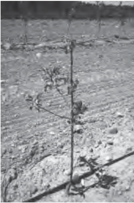
Figure 2. This newly planted orchard of Gala on M.9 with multiple blossom blight infections.

blight. This is often a recipe for disaster.