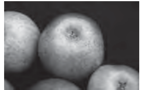
Figure 4. Black speckling and russet resulted from copper applications in cover sprays on Twenty Ounce apples. These are destined for the processor because they are not acceptable for fresh fruit.