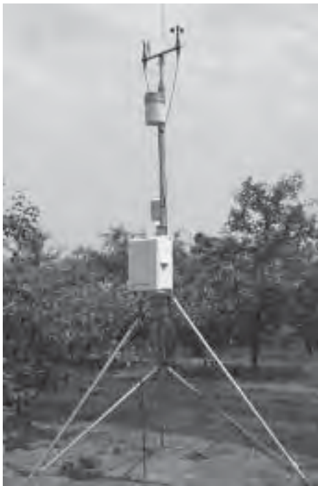
Figure 1. Weather stations are used to monitor maximum and minimum temperature and wetting periods from rain and dew. The data are entered into a disease prediction model to time streptomycin application to control blossom blight, and to predict symptom development for all phases of the disease.

Rootstock susceptibility is discussed in another paper in this issue of the Fruit Quarterly . The combination of highly susceptible scion varieties on highly susceptible rootstocks such as M.9 and M.26, often results in rootstock blight and tree death. In an ideal world, the market would only demand varieties that are resistant to fire blight. In the real world, however the first step in controlling fire blight is rec-