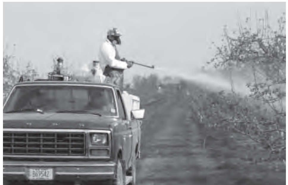
Figure 3. Experimental material is sprayed for control of fire blight.