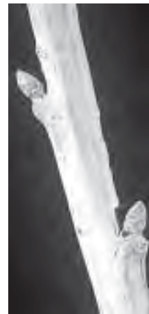
Figure 1. White latex paint applied to the bud and shoot marks the location of the Promalin® application.

"Notching" (N) was accomplished by cutting through the bark and cambial layer with a hacksaw blade above the selected buds (Fig. 2). This could also have been done using a knife or fine pruning saw. Cuts were deep enough to disrupt