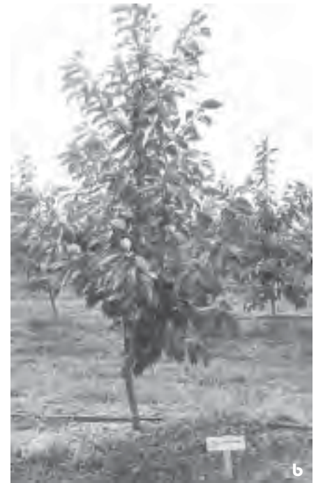
Figure 4. Bud Removal distributes side branching from top to bottom along the leader.