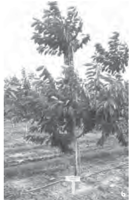
Figure 5. Blind wood in the lower portion of the leader was common in headed, Notched, and Promalin® treated leaders.