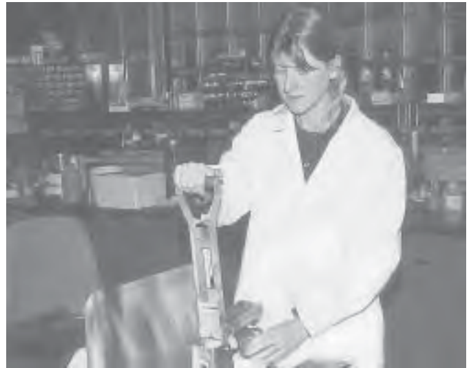
Photo 1. Firmness measurements were made using an Electronic Pressure Tester. (EPT).

This research was supported by the Grow New York Program (New York Department of Agriculture and Markets), the New York Apple Association, and Cornell