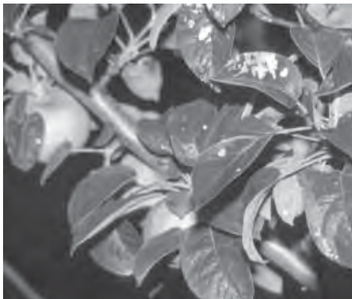
Figure 3. Foliar residue of paraffin-base pheromone formulation applied using paint marking guns.

Results of the pre-harvest fruit inspection in 2000 showed fruit damage from OFM feeding and infestation to be quite low in all the treatments, surpassing 1 percent in very few of the plots (Table 1). OFM injury was placed into one of two categories, with "stings" representing incidence of skin puncturing or nominal pitting progressing less than a few millimeters into the fruit, and the "internal" injury category reserved for actual tunnelling in the fruit flesh, with either the larva or its trail or frass evident when the fruit was cut. Inspection of the data reveals that few major differences among treatments