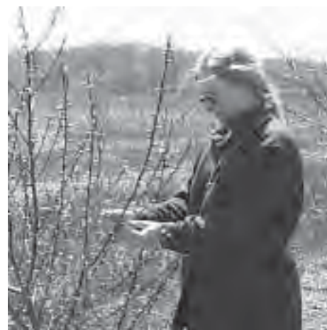
Figure 2. Application of twist-tie pheromone dispensers in young peach planting.