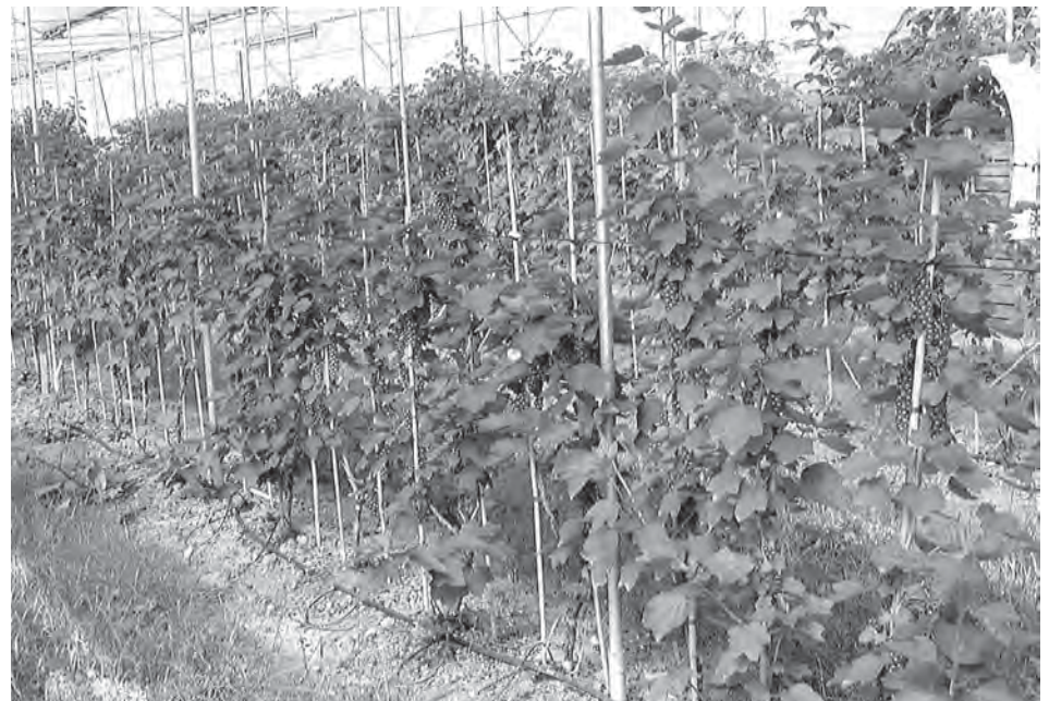
Young cordon-trained red currant plants.