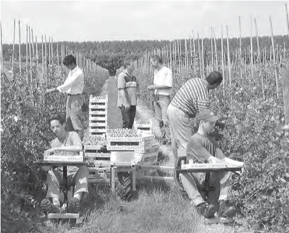
Harvesting cordon-trained gooseberries.