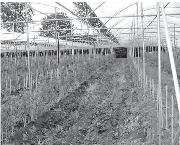
One-year red currant plants being established.

centimeters from the top. (An alternative to drilling is to use commercial wire clips since holes can weaken posts making them more susceptible to breakage or bending in wind or rusting. The clips available through orchard supply houses.) The posts could be spaced six to eight feet apart, with a number fourteen or twelve wire passed through the holes at the top of the stakes. At each end of the trellis, a conduit anchor post can be driven in, and the wire attached through a hole drilled near the top of the