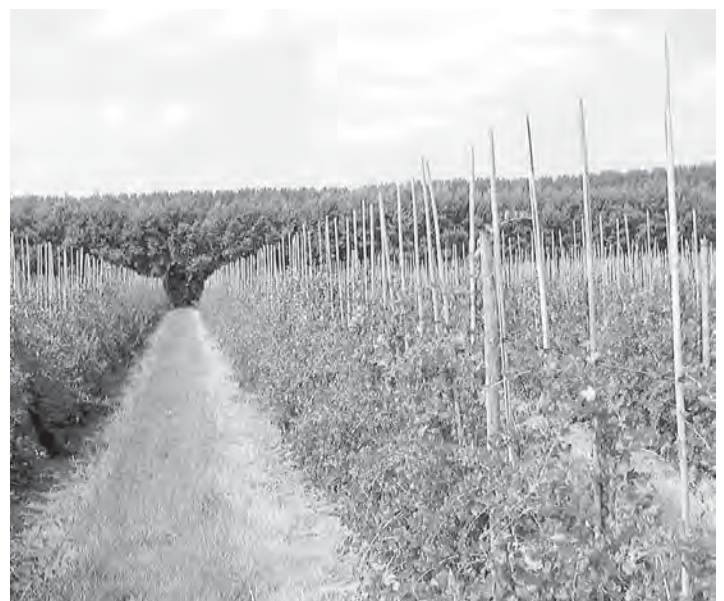
Young cordon-trained Dutch gooseberry plants.