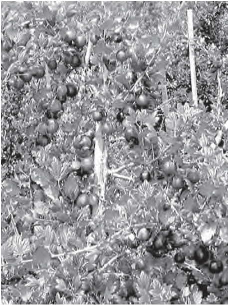
Heavy crop of gooseberries on cordon-trained plant.

es for the rest of the growing season. The five bud branches are shortened to two bud fruiting spurs during the dormant season pruning.