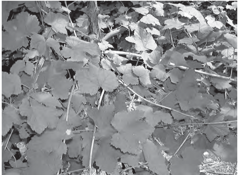
One-year branches chosen to be left on the cordon after harvest. All of the wood that fruited this year has been removed.

Gooseberries can be very difficult to harvest if they are of a thorny variety. Cordon training offers the advantage of opening up the plant and leaving the fruit accessible. In Holland, a single branch is selected and trained up a stake to a height of five to six feet. Only new, well spaced, medium-sized branches are left at the end of the growing season. Poorly spaced,