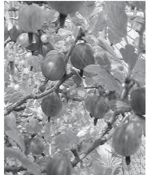
Cordon-trained, spur-pruned gooseberries in England.

post. Six-foot bamboo posts are then spaced as needed along the wire, pushed into the ground a couple of inches, and tied at the top. Green horticultural tape can be used to tie trunks to the posts.