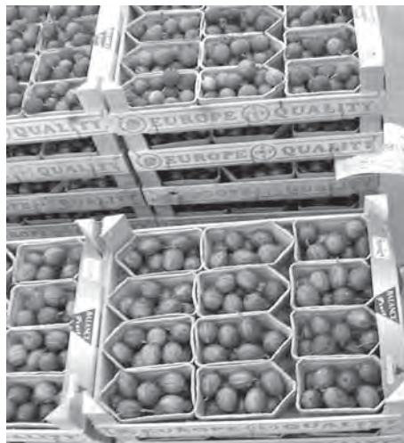
Large, quality gooseberries from cordon-trained plants.