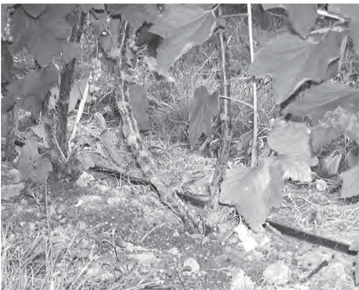
Replacement wood for new trunks is maintained at the base of the plant.

The approach for the first year was to be conservative with fertilizer