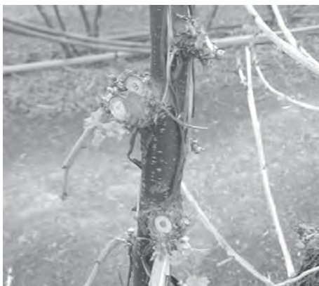
Medium-sized one-year branches are spaced radially around the cordon.

In England, semi-permanent branches are selected evenly spaced along the cordon. In late June each year, poorly placed and crowding branches are removed leaving five to seven bud branch-