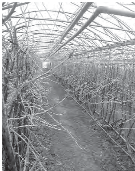
Mature cordon-trained red currants in a Dutch greenhouse for early fruit production.